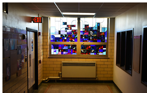
STAINED GLASS FROM FORMER CHAPEL

To view an online version of this book, visit dsha.info/chapel .