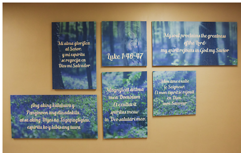
THE WORDS OF MARY AT THE VISITATION

The Mother of Our Savior Chapel ceremonial doors open to The Quad and overlook the main social gathering area of DSHA. Next to The Robert and Marie Hansen Family Fine Arts Theatre, fine arts wing, academic building, and the health & wellness center, the chapel symbolically pays tribute to the DSHA Mission Statement, which states “...we develop our students into capable young women of faith, heart and intellect who accept the Gospel call to live lives that make a difference.” The chapel under this title of Mary, the first servant of Christ, stands at the very heart of our complex as a constant reminder of our call to our mission and to live the values of the Gospel we have inherited from our founders.