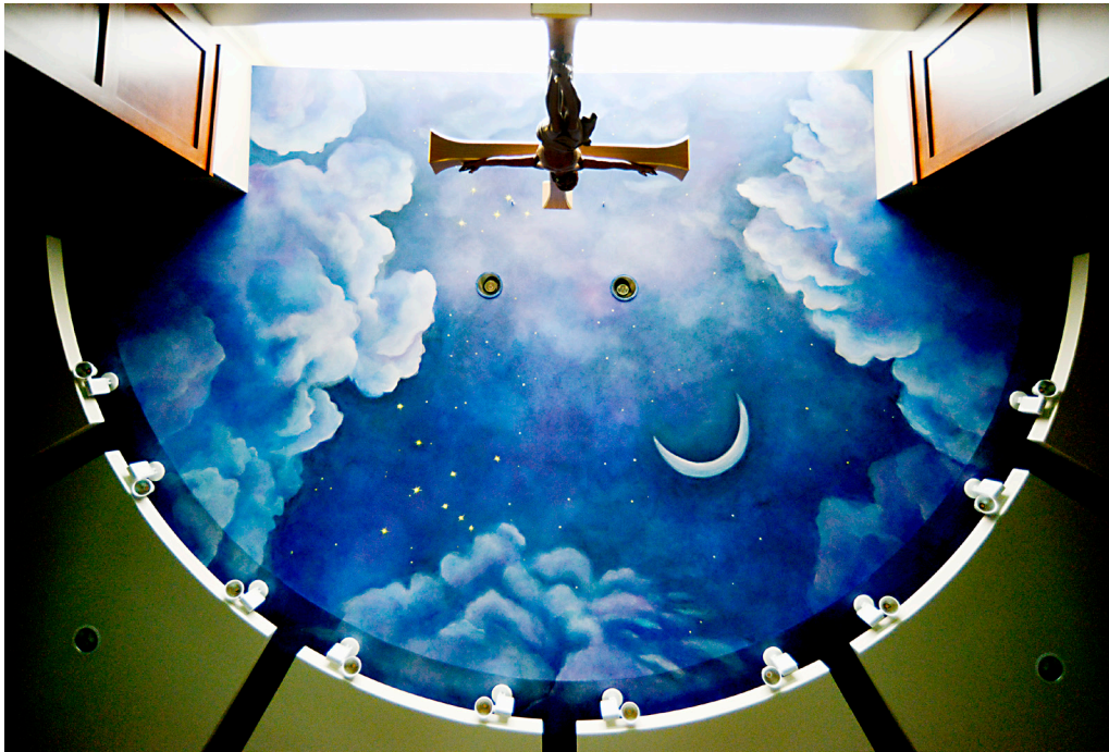
MANTEL OF OUR LADY

“Originally, I went into my first optional liturgy looking for validation, a ‘pat on the back’ for actually going to Mass; instead, I discovered the most beautiful and blessed community that I have ever experienced – DSHA Campus Ministry. I am so thankful for the weekly optional liturgies because of the huge impact and contributions to my prayer life.”