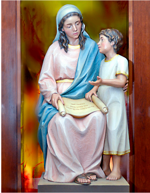
SHRINE OF THE MOTHER OF THE SAVIOR

“The Chapel has enhanced my practice of Mass, prayer, and rosary. I enjoy going to the weekly optional liturgies in the Chapel and praying the rosary beforehand.”