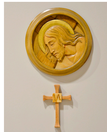
STATIONS OF THE CROSS