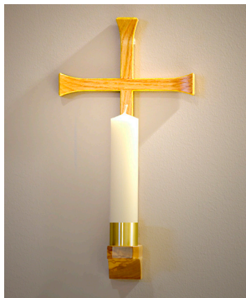
DEDICATION CANDLES & CROSSES

In the four corners of the Chapel are the four dedication candles and crosses. These candles recall the date of the dedication of the space and are lit on the anniversary of the dedication and the feasts of Mary.