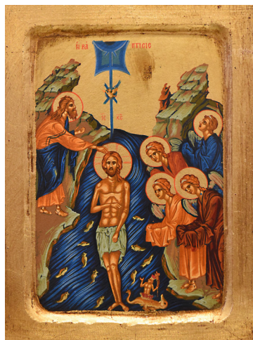
THE BAPTISM OF JESUS

Each of these four, authenticated icons depicts important moments from Salvation History and the Life of Jesus, our Divine Savior. The four icons depict the Nativity, the Baptism of Our Lord, the Crucifixion and the Resurrection.